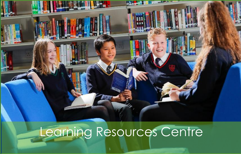
Learning Resources Centre

All year 7 students participate in an LRC induction during their first few weeks at Warlingham School. This enables them to visit the LRC and learn how to take advantage of the resources available.